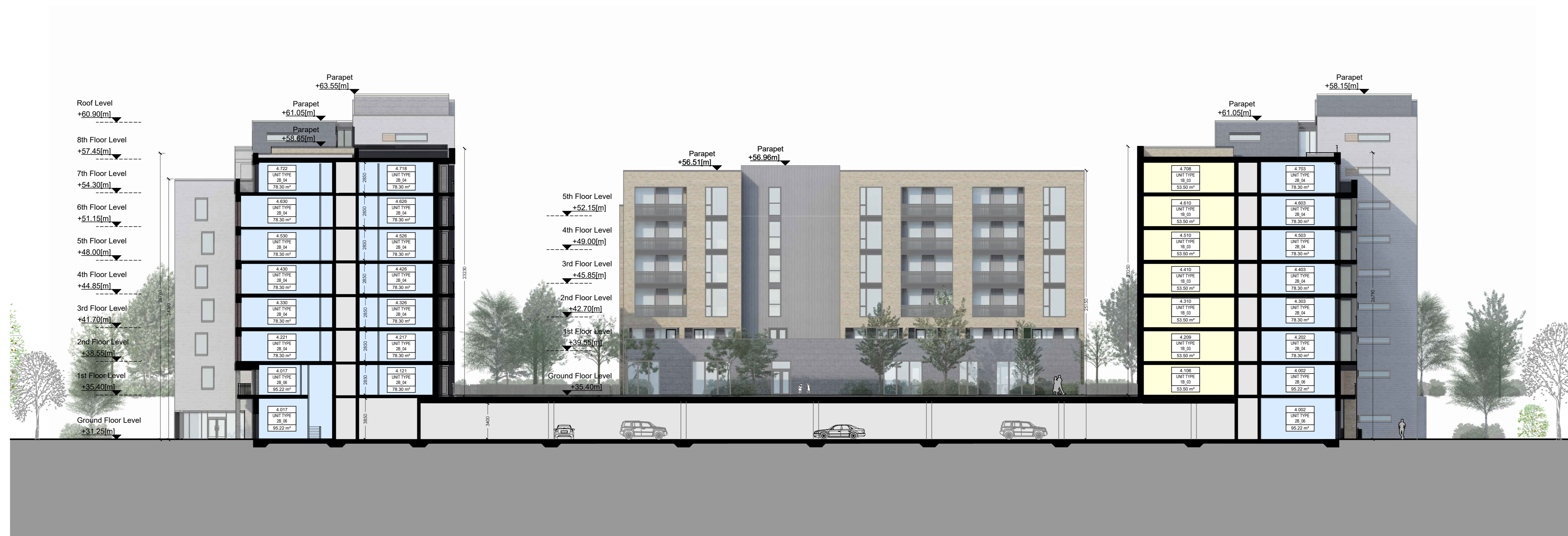
Section BB - Block 4 Scale 1:200 @A0